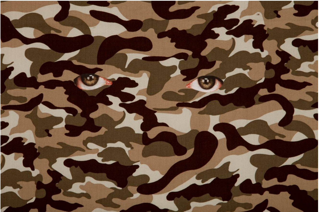
Image: Tony Garifalakis, The Hills Have Eyes (detail) 2012, fabric collage, 170 x 130 cm.

Further information on the TarraWarra Biennial 2014: Whisper in My Mask